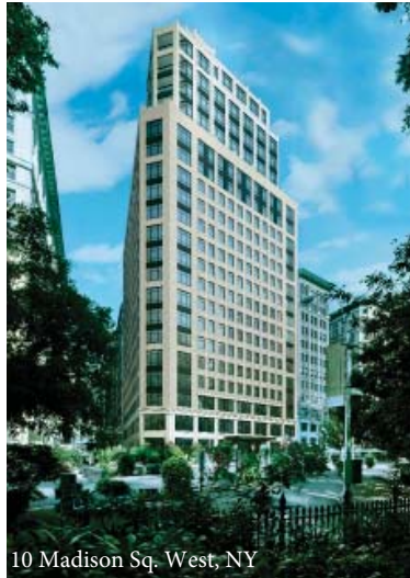
10 Madison Sq. West, NY