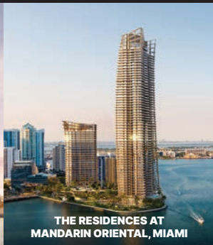
THE RESIDENCES AT MANDARIN ORIENTAL, MIAMI