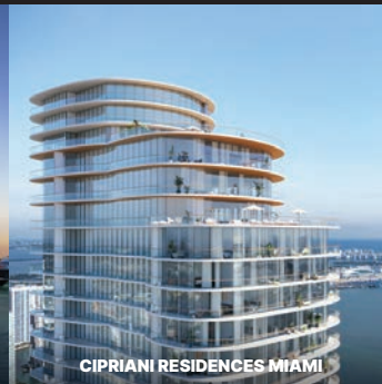
CIPRIANI RESIDENCES MIAMI