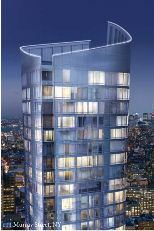
111 Murray Street, NY