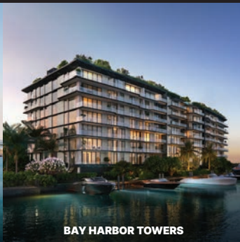
BAY HARBOR TOWERS