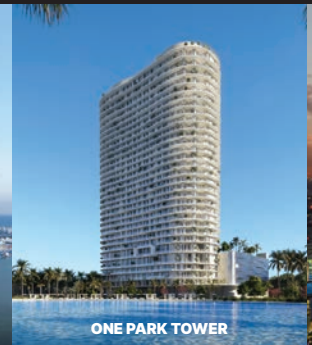
ONE PARK TOWER