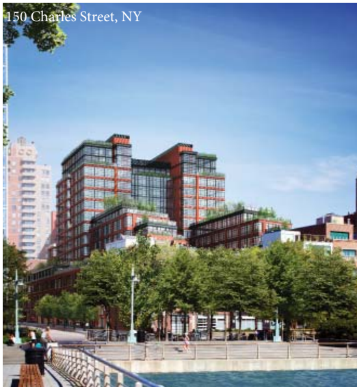
150 Charles Street, NY