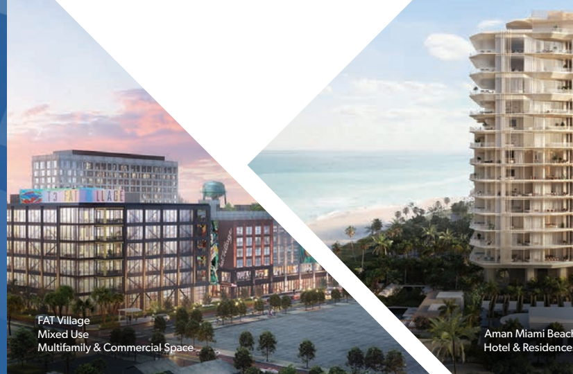
FAT Village Mixed Use Multifamily & Commercial Space