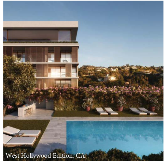
West Hollywood Edition, CA