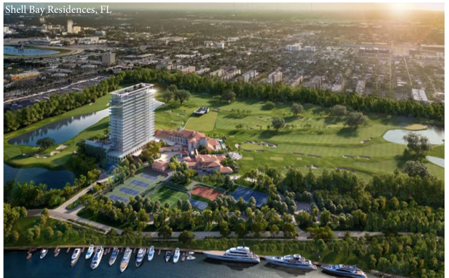
Shell Bay Residences, FL

A NEW ERA IN LUXURY PROPERTIES AND FORWARD THINKING DEVELOPMENT